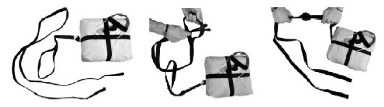
The reserve parachute bridle is not included with the harness.

This connects the two bridles. The loops should be pulled as tight as possible to avoid any chance of dangerous friction developing between the two bridles during the shock caused when the reserve parachute opens.