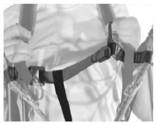
Each setting the harness must be done with mounted protector, rescue system and be symmetrical on both sides.